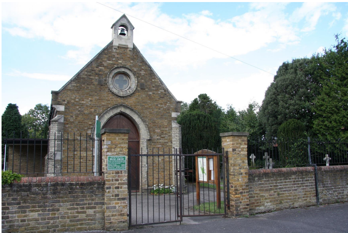
Molesey Cemetery

Molesey Cemetery contains 21 Commonwealth War Graves – 10 from World War 1 & 11 from World War 2.