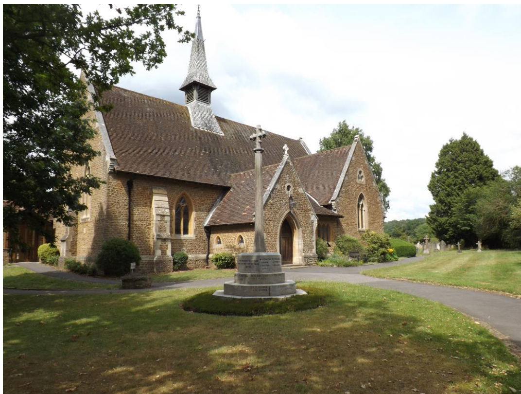
Shamley Green War Memorial